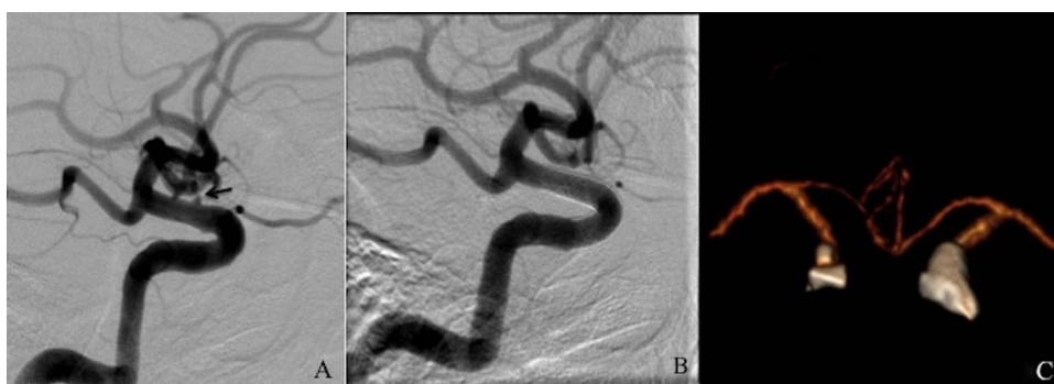
Figure 2 (A) Digital subtraction angiogram in patient 2 before deployment of the Pipeline Embolization Device (PED) showing a dorsal supraclinoid paraclinoid internal carotid artery blister aneurysm (black arrow). The aneurysm remained occluded at 7 weeks (B) and 9 months (C) after PED placement.

The remaining hospital courses of the three patients were uneventful. Patients 1 and 2 were discharged home and early follow-up DSA was performed at 6 weeks (figure 1C) and